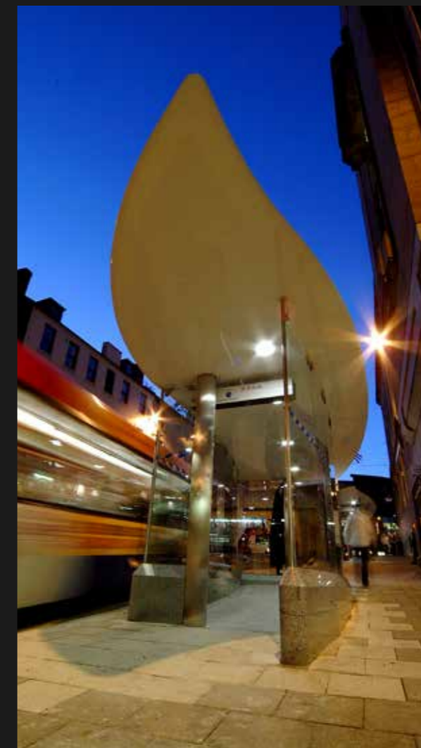
Dundee Bus Enclosure