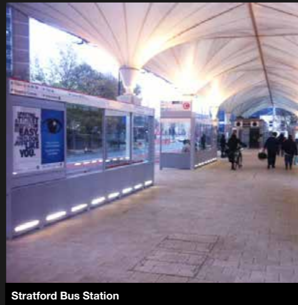
Stratford Bus Station