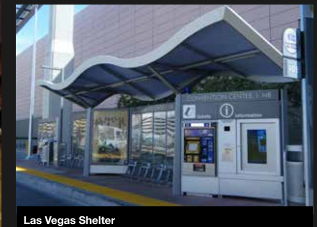
Las Vegas Shelter