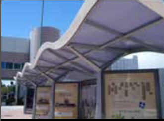
Canopies & Walkways