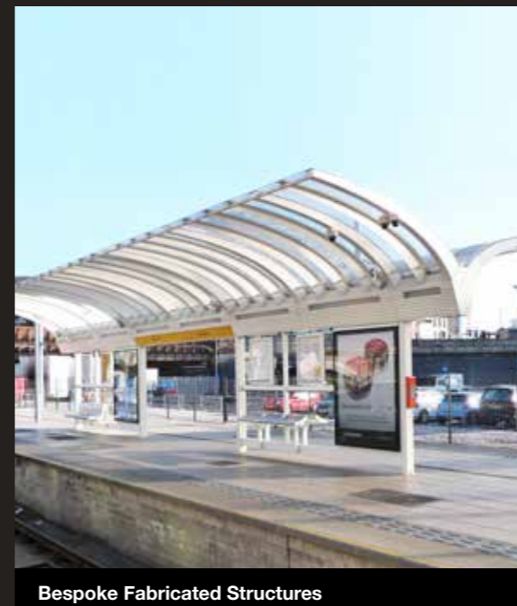
Bespoke Fabricated Structures