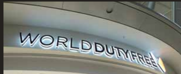
Fabricated Fascias & Signage

Trueform's combined expertise in design, engineering, fabrication, sheet metal component and sub-assembly development, product finishing and site erection can help our customers to minimize programme time by identifying, reducing or eliminating problems with production by producing total engineering solutions.