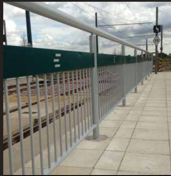
Balustrades & Handrails

Please visit our website for a detailed portfolio of recently completed case studies.