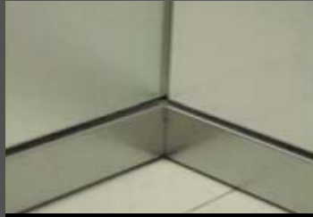
Architraves & Skirting