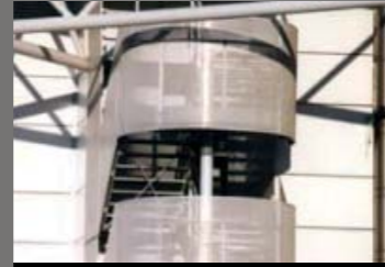
Balustrade Infill Panels