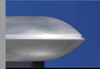
Bull Nosing & Feature Flashing