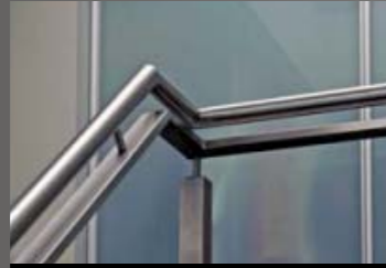
Balustrades & Handrails