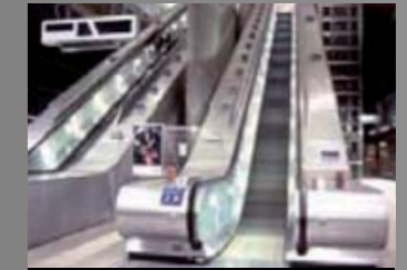
Escalators & Moving Walkways